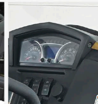
DIGITAL / ANALOG